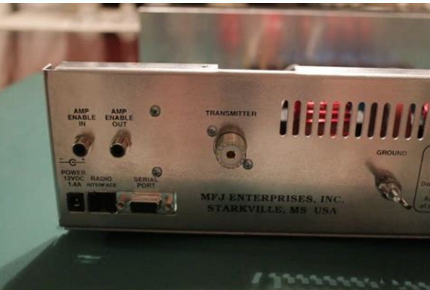
MFJ-993b manual. MFJ-993b manual deutsch. MFJ-1664 review. MFJ 993b manual español. MFJ 993b tuner manual. MFJ-993b manual pdf. MFJ-993b manuale italiano. MFJ-993b service manual.